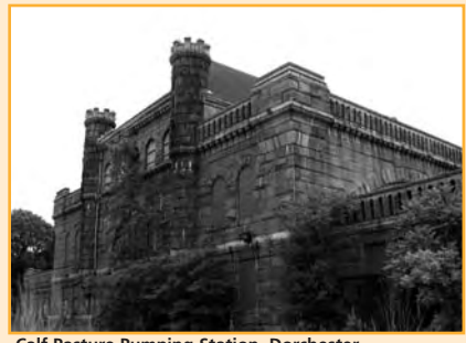
Calf Pasture Pumping Station, Dorchester