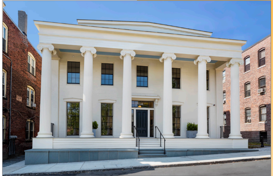
The rehabilitation of the Alvah Kittredge House completed in 2014.