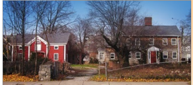
The Fowler Clark Epstein Farm before rehabilitation.