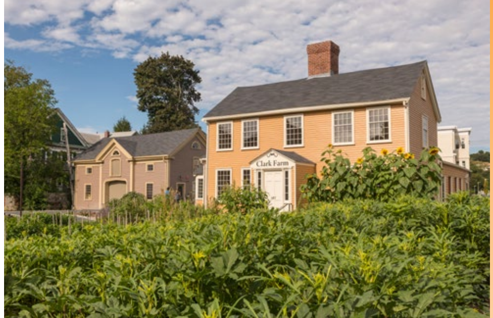
Fowler Clark Epstein Farm today.