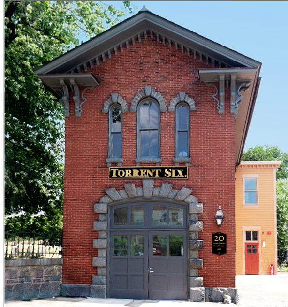
The oldest remaining fire house building in Boston, the Eustis Street Fire House was built for the Town of Roxbury in 1859.