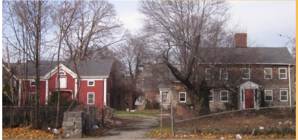
The original farmhouse (c. 1786 - 1806) and barn (c. 1860) before restoration.