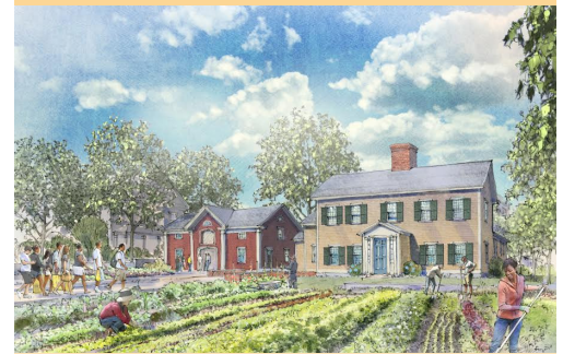
Rendering of the Fowler Clark Epstein Farm